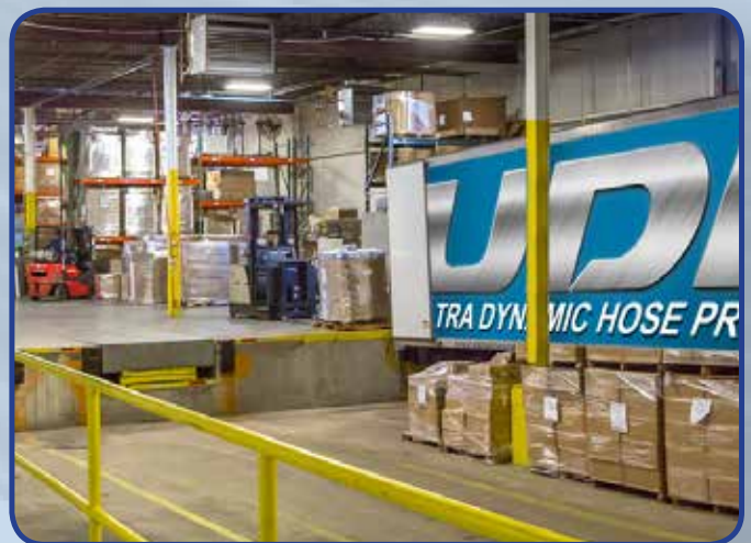
Shipping to customers world-wide with world-class hose and tubing products.