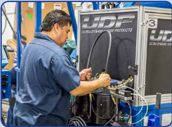
Hose assemblies fabricated to customer requirements - our specialty. Let us know what your requirements are.