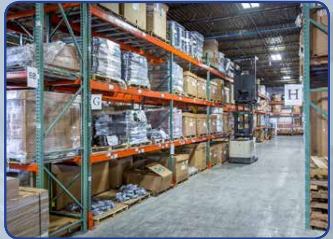
Inventory on-hand to service our customer needs. Large stocks for immediate shipment.