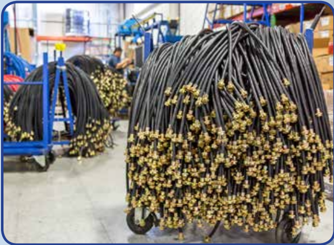
Producing hose assemblies in large quantities is a daily routine.