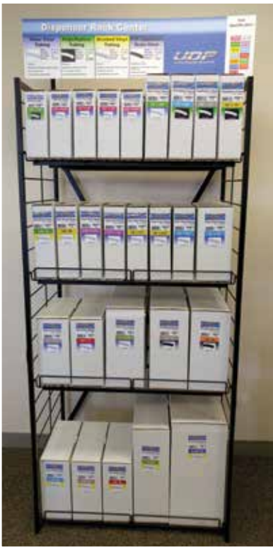
3 Ft BOX DISPENSER RACK