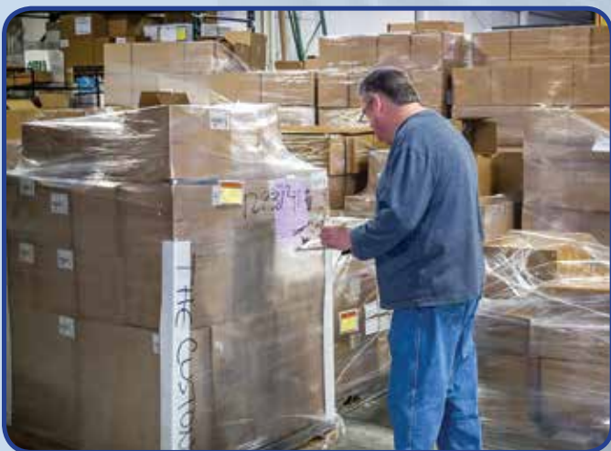
Inspection and quality is paramount with unparalleled customer service.