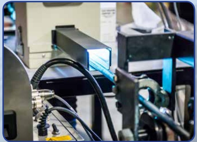
Hose branding - just one of the value added services we offer. Cut-to-length and special packaging available.